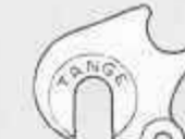
Forged End (1217)