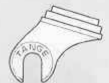
Investment Cast End (1224 For 28.6 Blade) (1228 For 31.8 Blade)