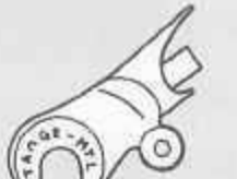
Investment Cast MTL End (1220)