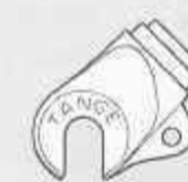
Investment Cast End (1229)