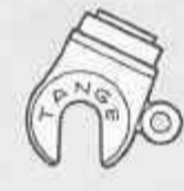
Investment Cast End (1232)