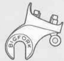
Investment Cast End (1240)