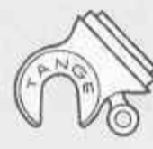
Investment Cast End (1234)