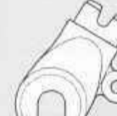
Investment Cast End (1222)